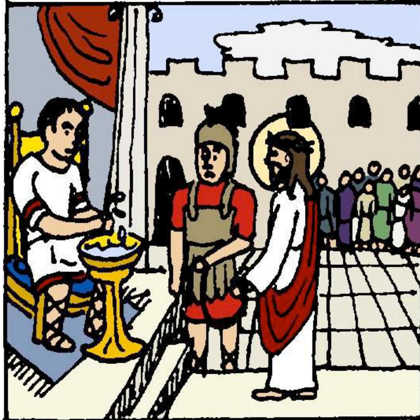
1. Jesus is condemned to death