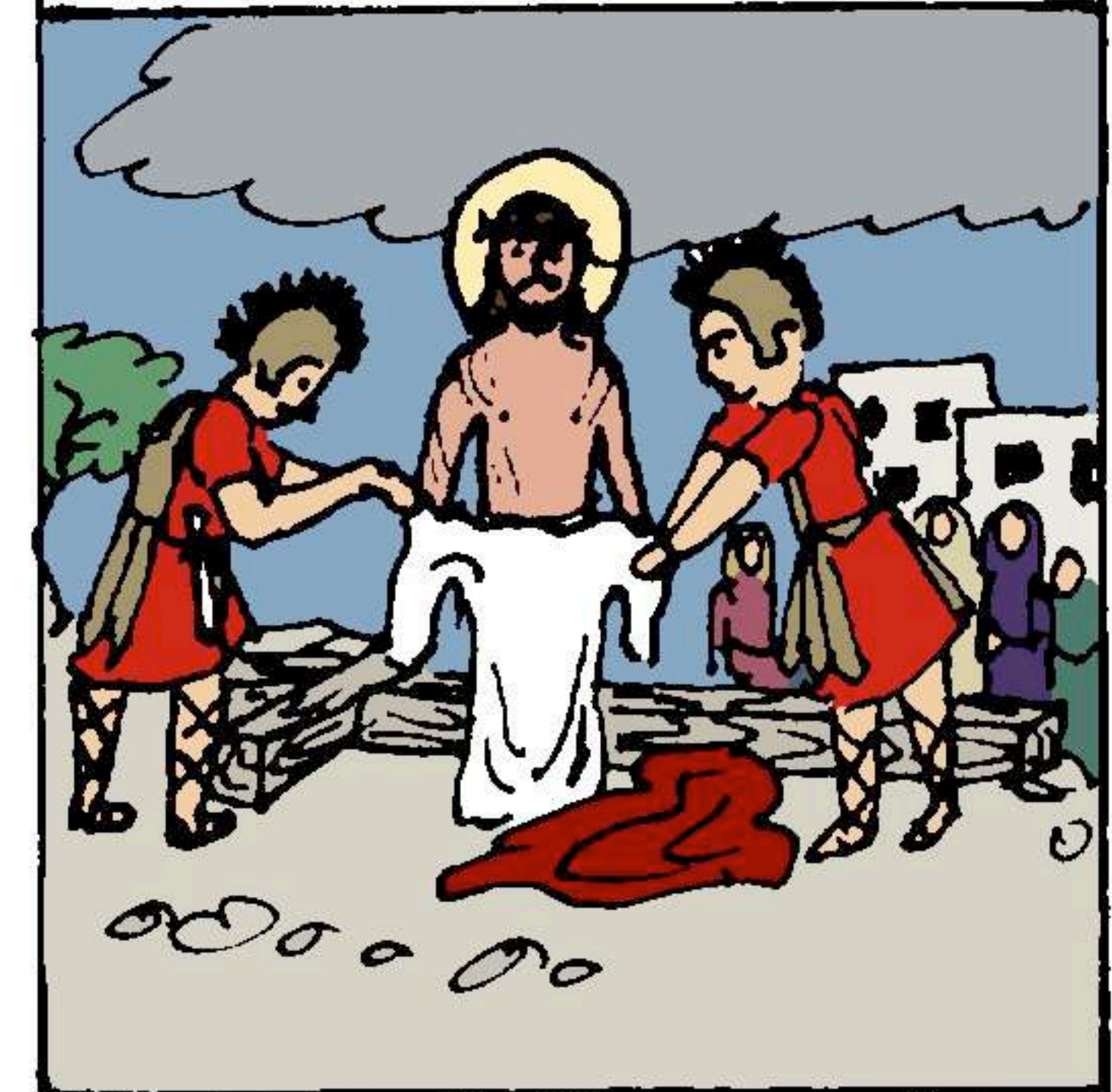
10. Jesus is stripped of His clothing