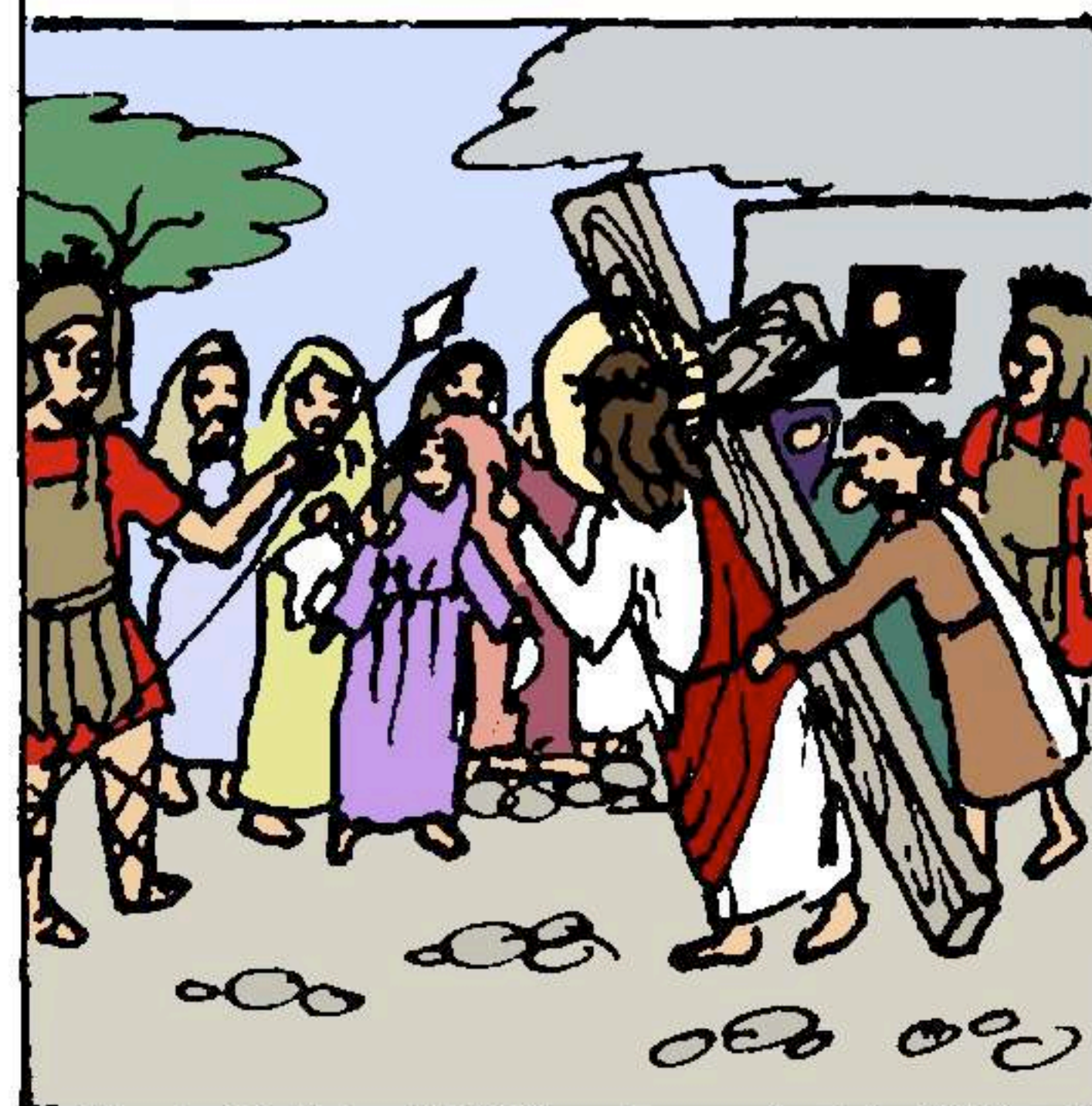
8. Jesus speaks to the women of Jerusalem