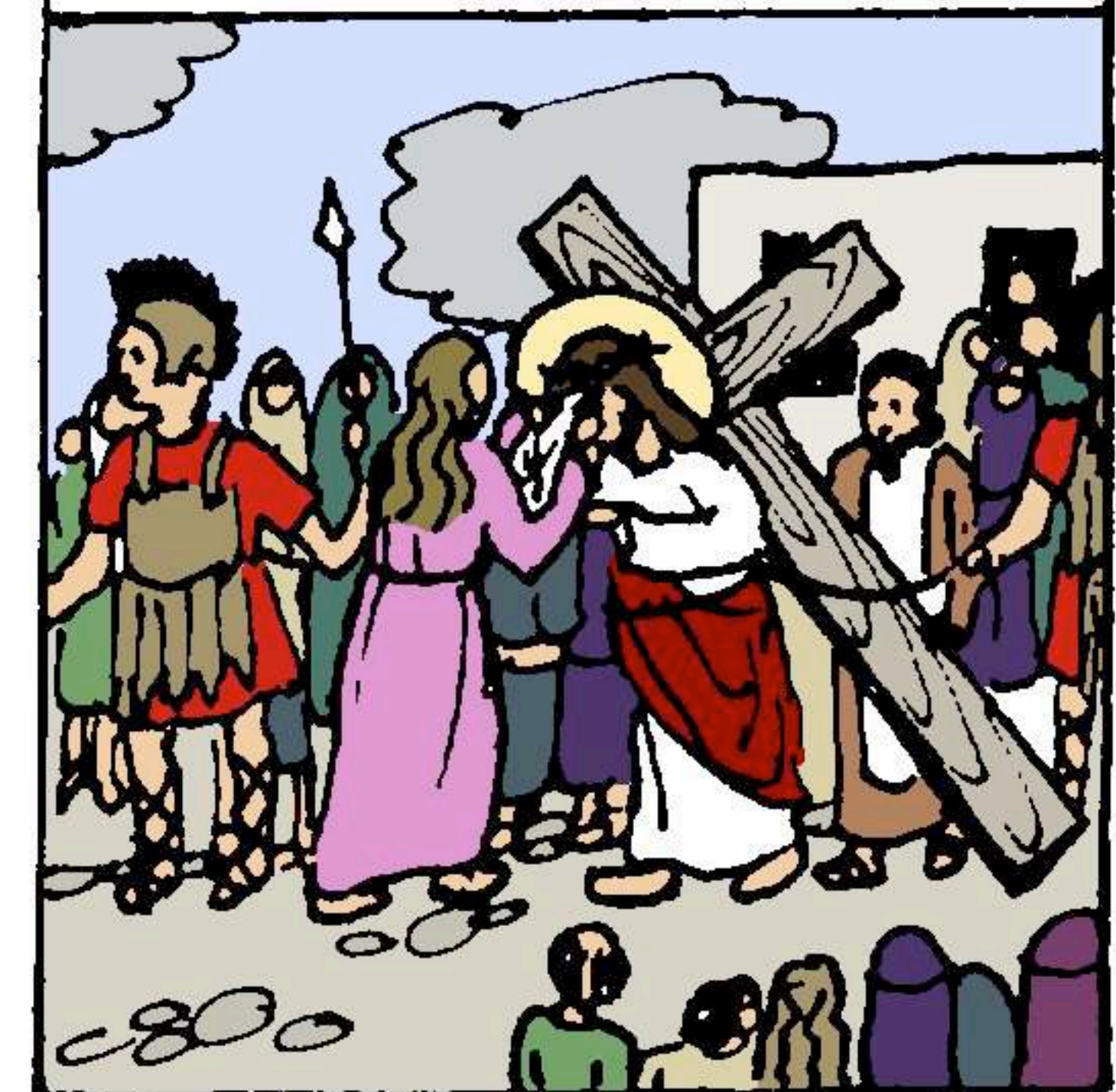
6. Veronica wipes the face of Jesus