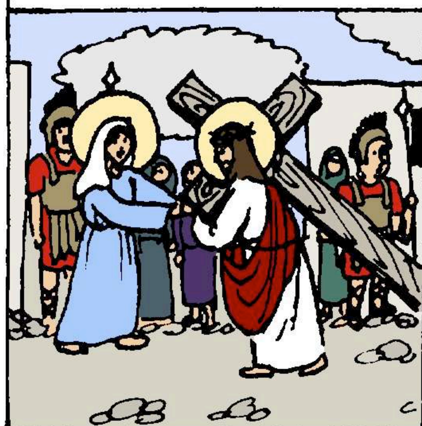
4. Jesus meets His mother