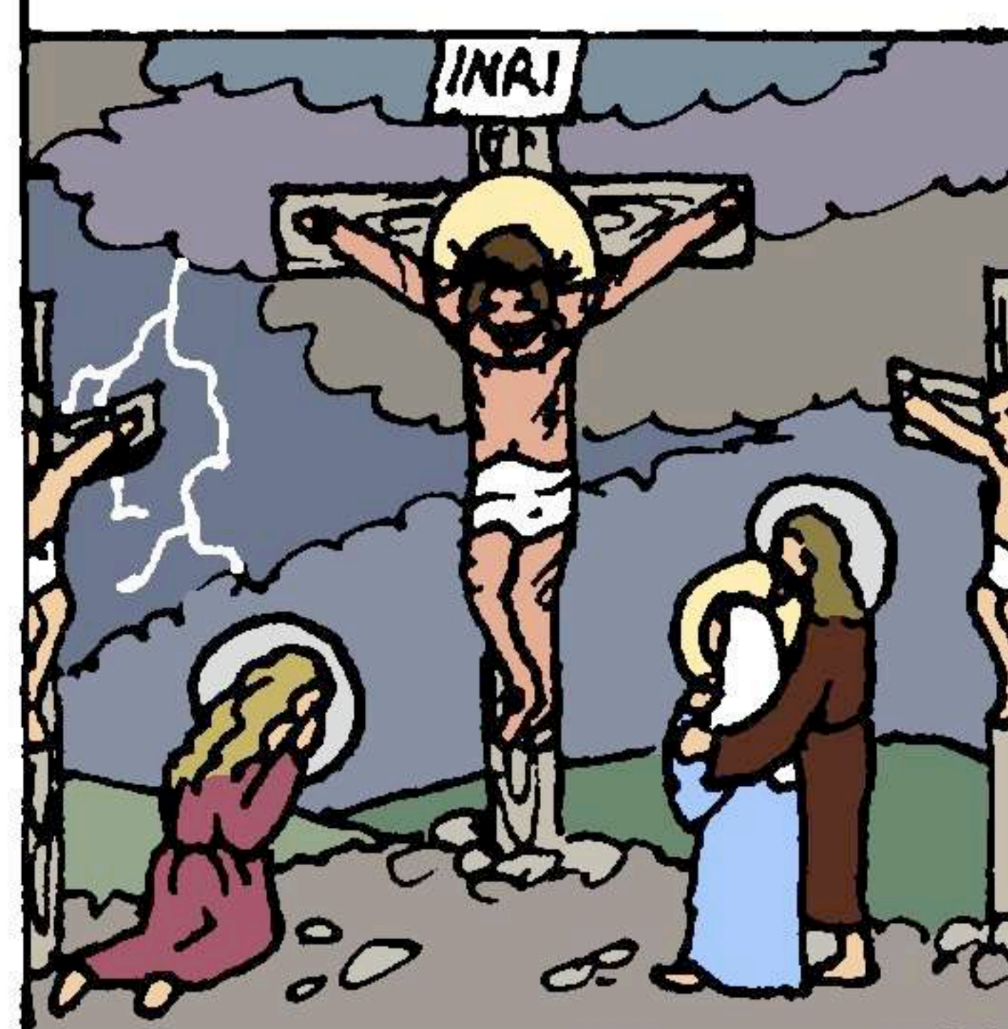
12. Jesus dies on the cross