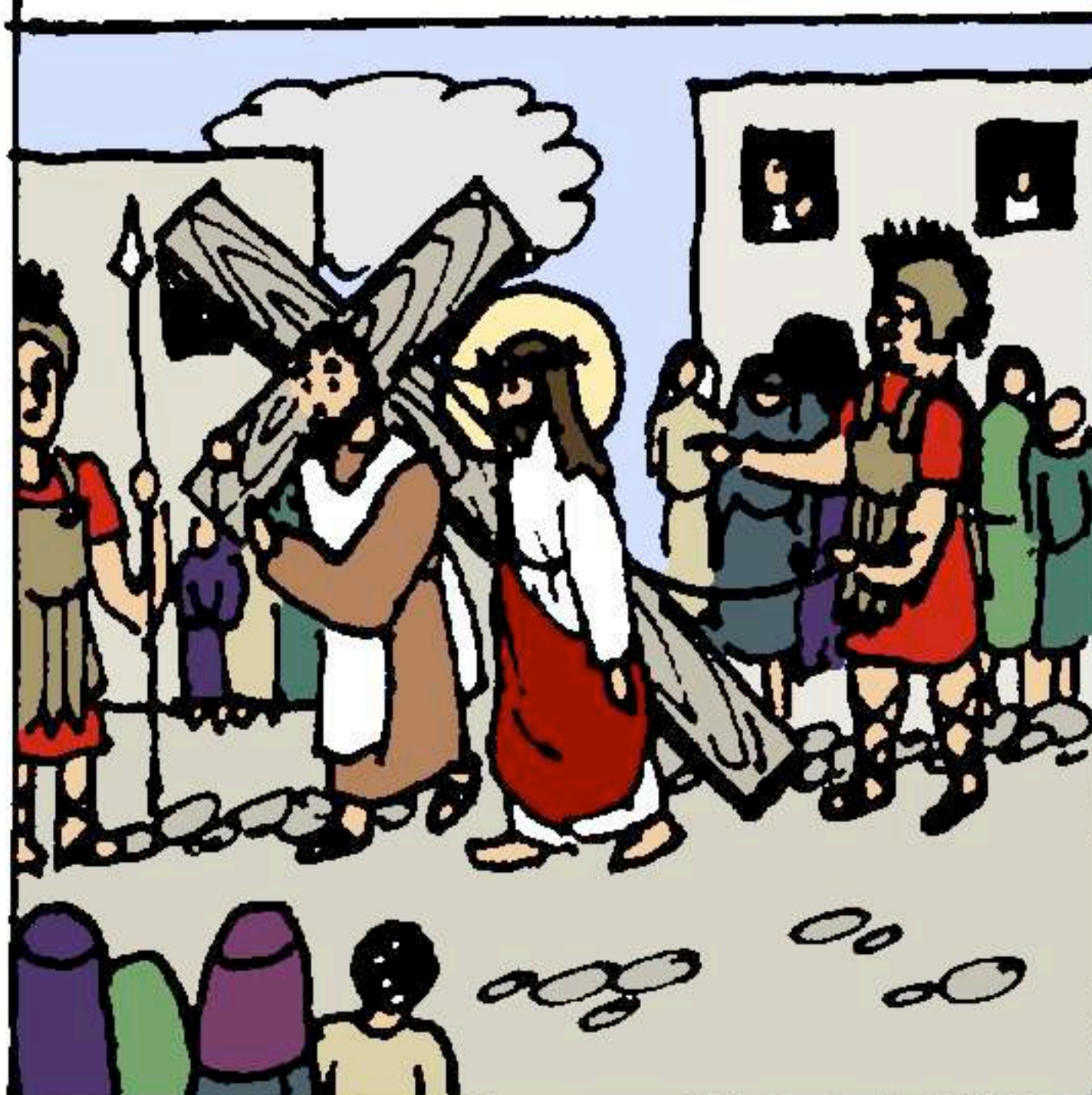
5. Simon helps Jesus carry the cross