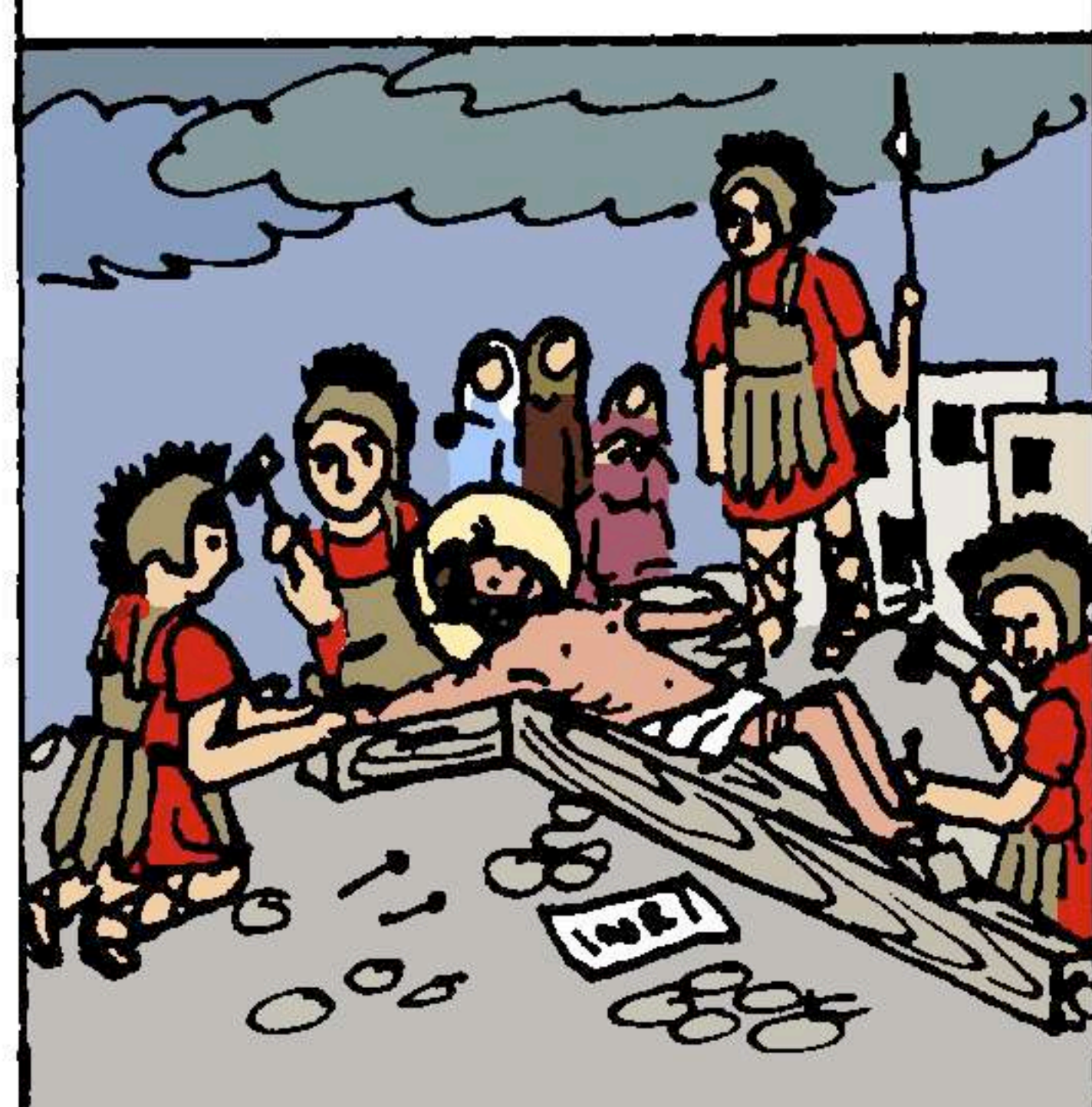
11. Jesus is nailed to the cross