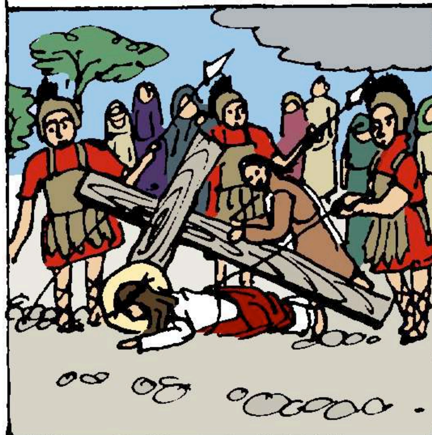
9. Jesus falls the third time