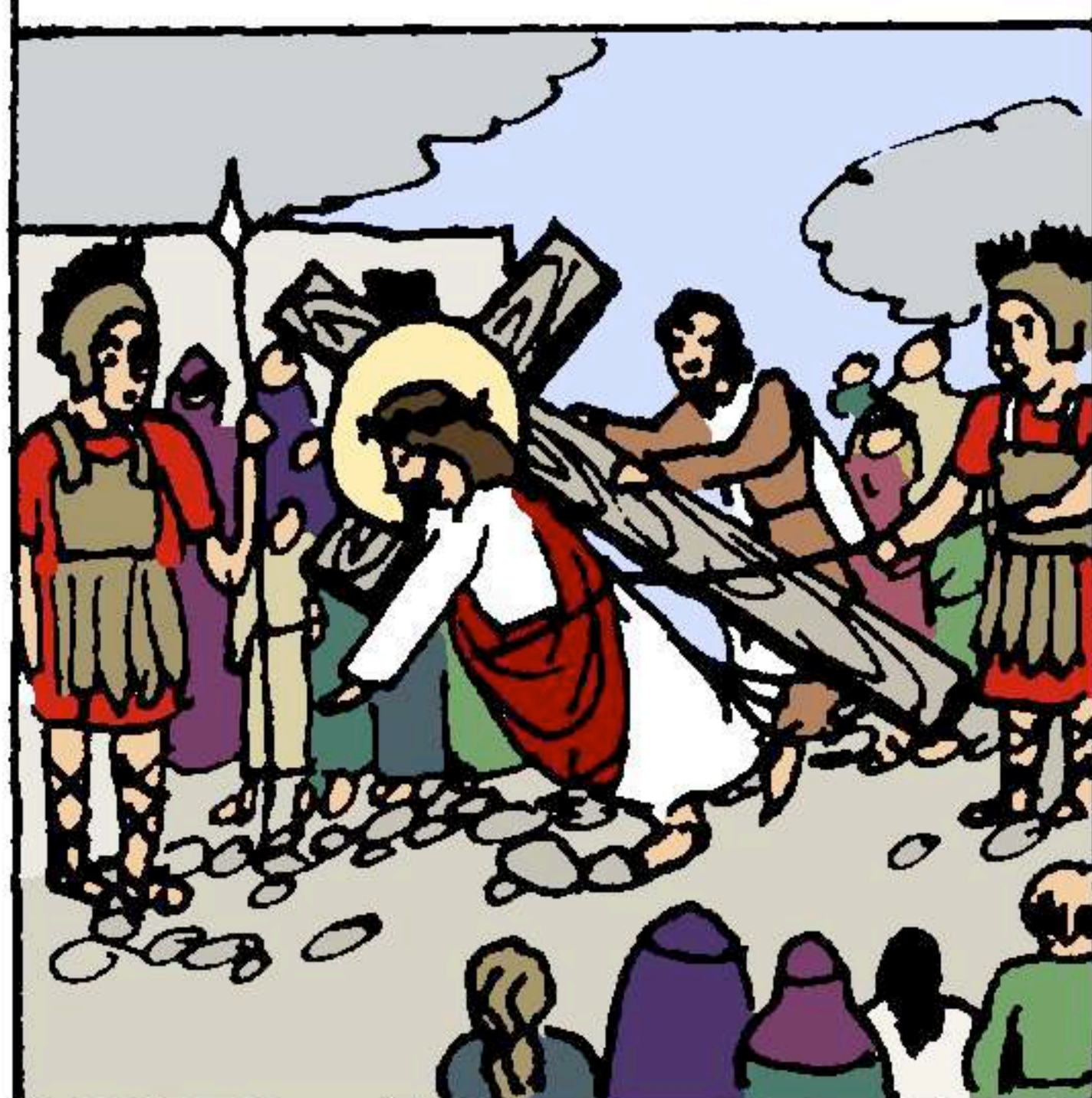
7. Jesus falls the second time