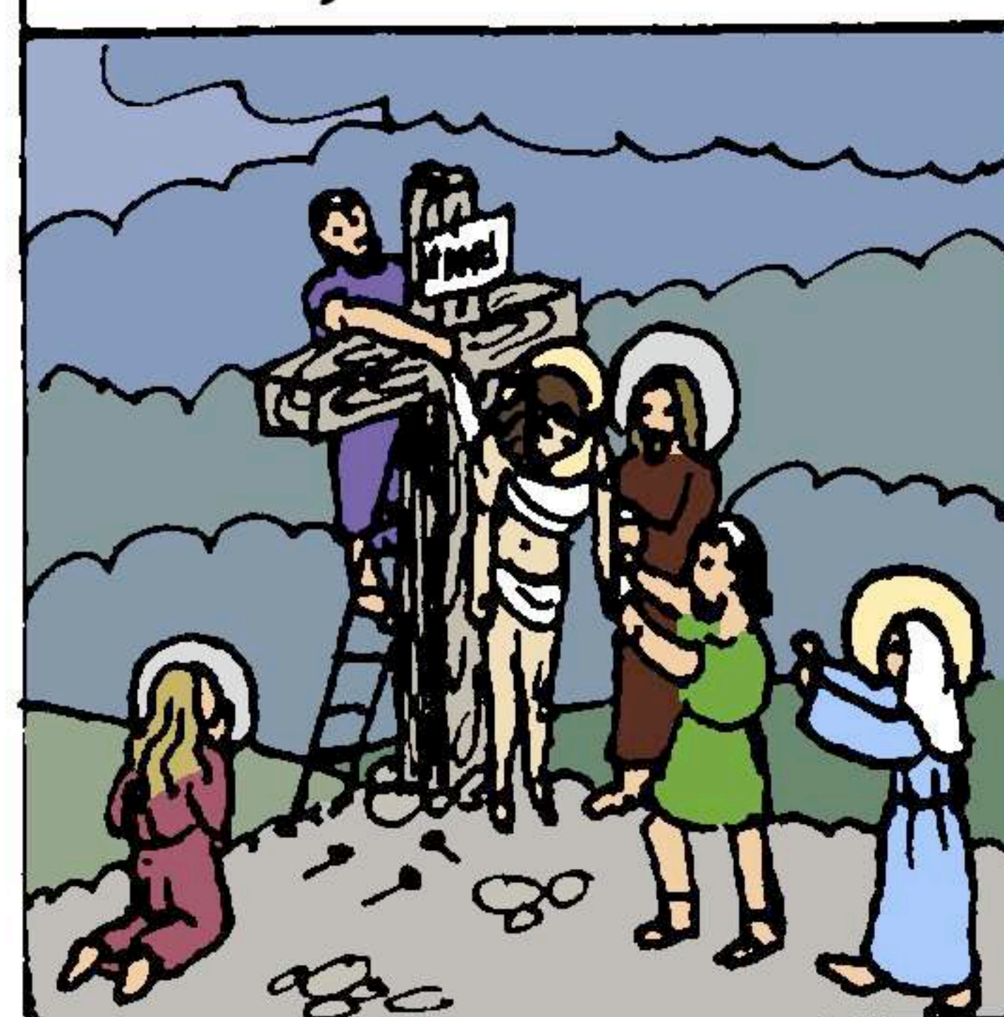
13. Jesus is taken down from the cross